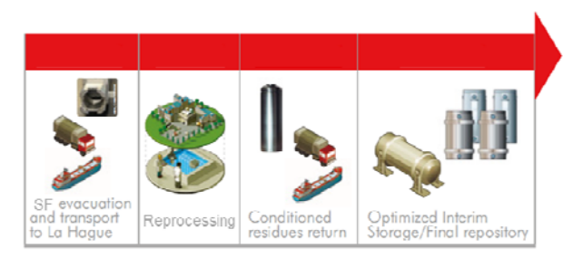
Fig. 4 Timeline of the reprocessing project execution phase

This overall timeline is described in the Fig. 4 below and is 10 to 40 years long depending on the reprocessing scenarios and the concluded IGA.